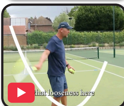
How to Improve your Serve