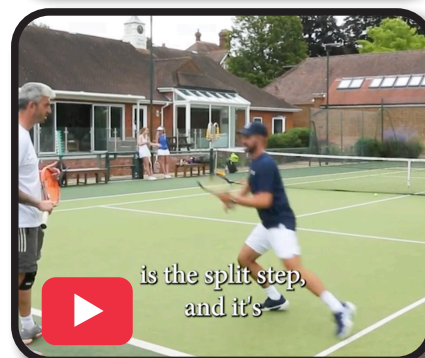
The Split Step