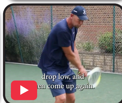
The Backhand Path